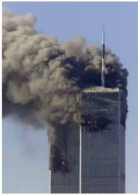
9/11/01, New York City, after two hijacked planes crashed into the twin 110 story WTC towers.

cooperating and working in other areas that affect the growth of terrorism such as economics, security, justice cooperation, elimination of poverty, education, money laundering, promoting freedom and equality among people. Cooperation among states is increasing on different levels, including, but not limited, to bilateral and multilateral agreements and inside organizations like EU and NATO. For example, the EU after the attacks in Madrid appointed a Special Counter-Terrorism coordina-