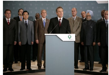
President Bush and fellow G8 leaders stand behind England's Prime Minister Blair Thursday, July 7, 2005, as he addressed the media regarding the terrorist attacks that occurred in London earlier in the day.

The democracies should seize upon this cooperative momentum among democracies and other states as a good occasion to promote deeper transatlantic relations. Mr. Alan Charlton, UK Deputy Ambassador, emphasized this in a speech at the National Press Club on Sept. 21, 2005. He also stressed the importance of fighting terrorism not only by confronting it, but by